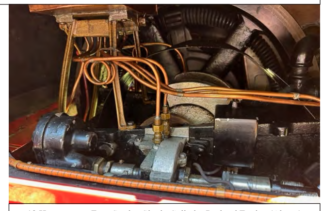
12 Horsepower, Four Stroke, Single Cylinder Packard Engine (Above) Ohio Automobile Co. badge, and Chain Drive (Below)